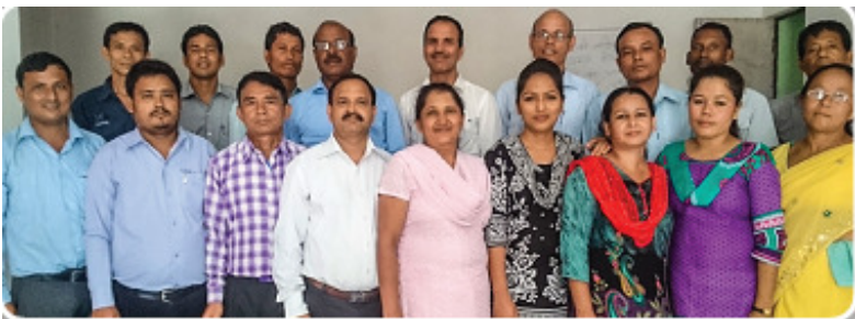
Bhutan ramrî vêla thawktûte

Kum 2014 kuartar 2-naa Southern Asia Division tâna in Thirteenth Sabbath Thawhlawm hmang khân Bhutan rama meeting hall sak a ni a, Bhutan ramri hrûla training center tharah hian Bhutan ram ațanga India rama lo lût lay worker-te chu training pêk an ni. Ringtharte puala biak in leh naupangte tâna Sabbath sikul class neihna tûrte pawh sak a ni bawk. Bhutan mîte zînga hnâ thawh a nih theihna tûra in thawhlawm thawh chungah khân lâwmthû kan sawi mawlh mawlh a ni e!